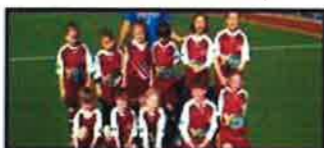
LOTS OF FUN FOR THE KIDS FACEPAINTING & JUMPING CAST

COME & CHEER ON OUR U9'S, JUNIORS & DIV 3 TEAMS ON SATURDAY!